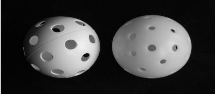
Figure 2-2. The Ball.

The ball pictured on the left of Figure 2-2 is customarily used for indoor play and the ball pictured on the right is customarily used for outdoor play. However, all approved balls are acceptable for indoor or outdoor play. The complete list of approved balls is on the IFP website.